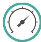
Maximum working pressure