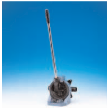
ND 4428 Floor Mounted pump with long handle