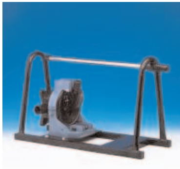
ND4424 Portable Pump