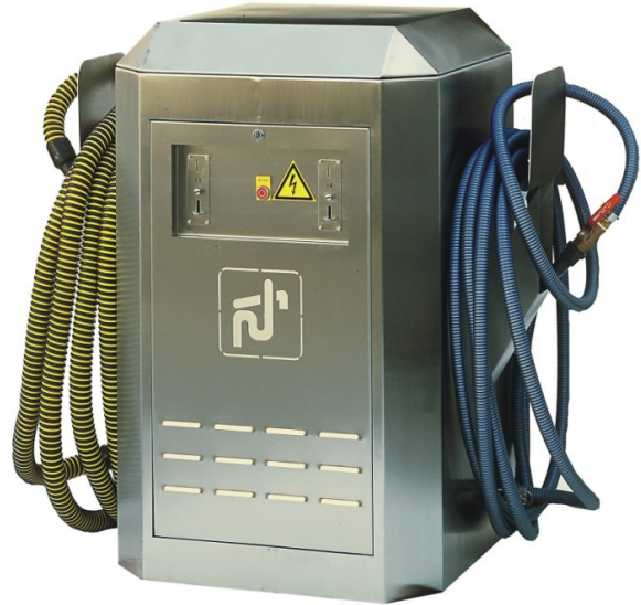
Part No. LS160W-B