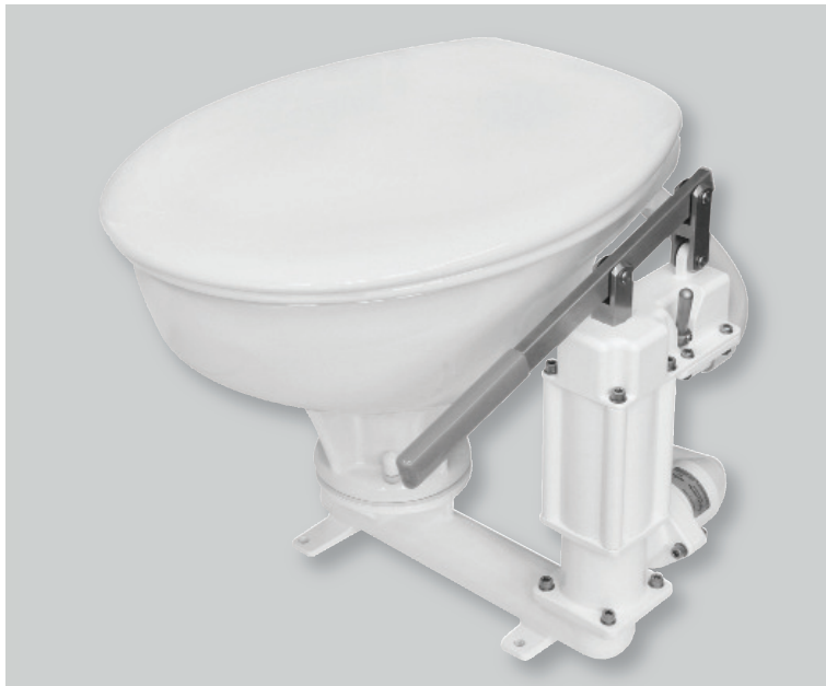
Hand Pump Y3